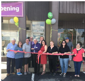
Diamond Optical Ribbon Cutting

June Event Pictures - Click here to view more pictures!