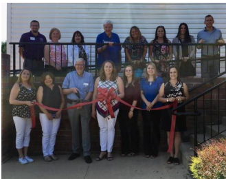
Stow Smiles Ribbon Cutting