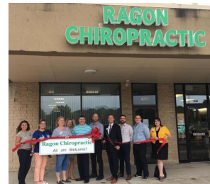
Ragon Chiropractic of Hudson